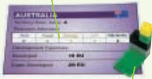
Extra R-Units for PS